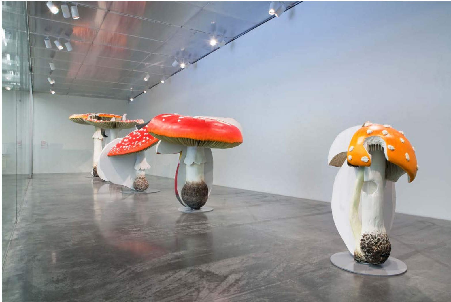
Giant Triple Mushrooms , 2010. Installation view, "Experience," New Museum.