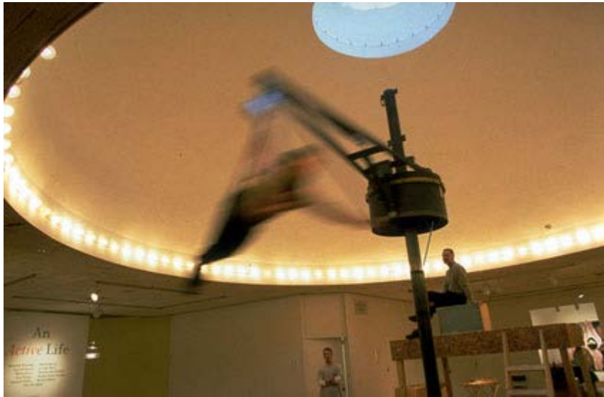
Flying Machine, 1994