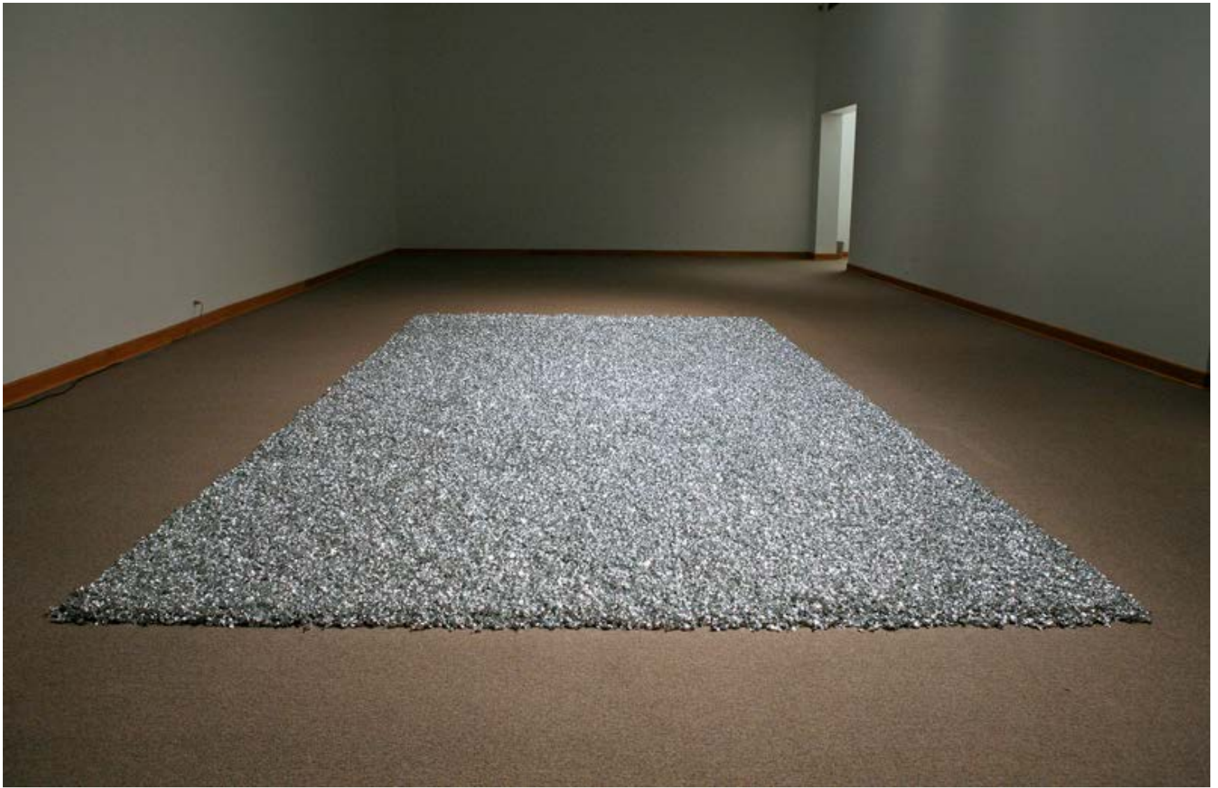
Felix Gonzales-Torres, Untitled (placebo), 1991, infinite supply of silver wrapped candies