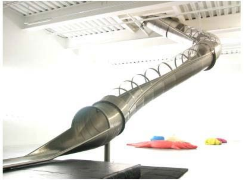
Untitled (slide), 2011, new museum