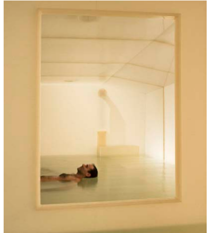
Giant Psycho Tank , 1999. Installation view, "Experience," New Museum.