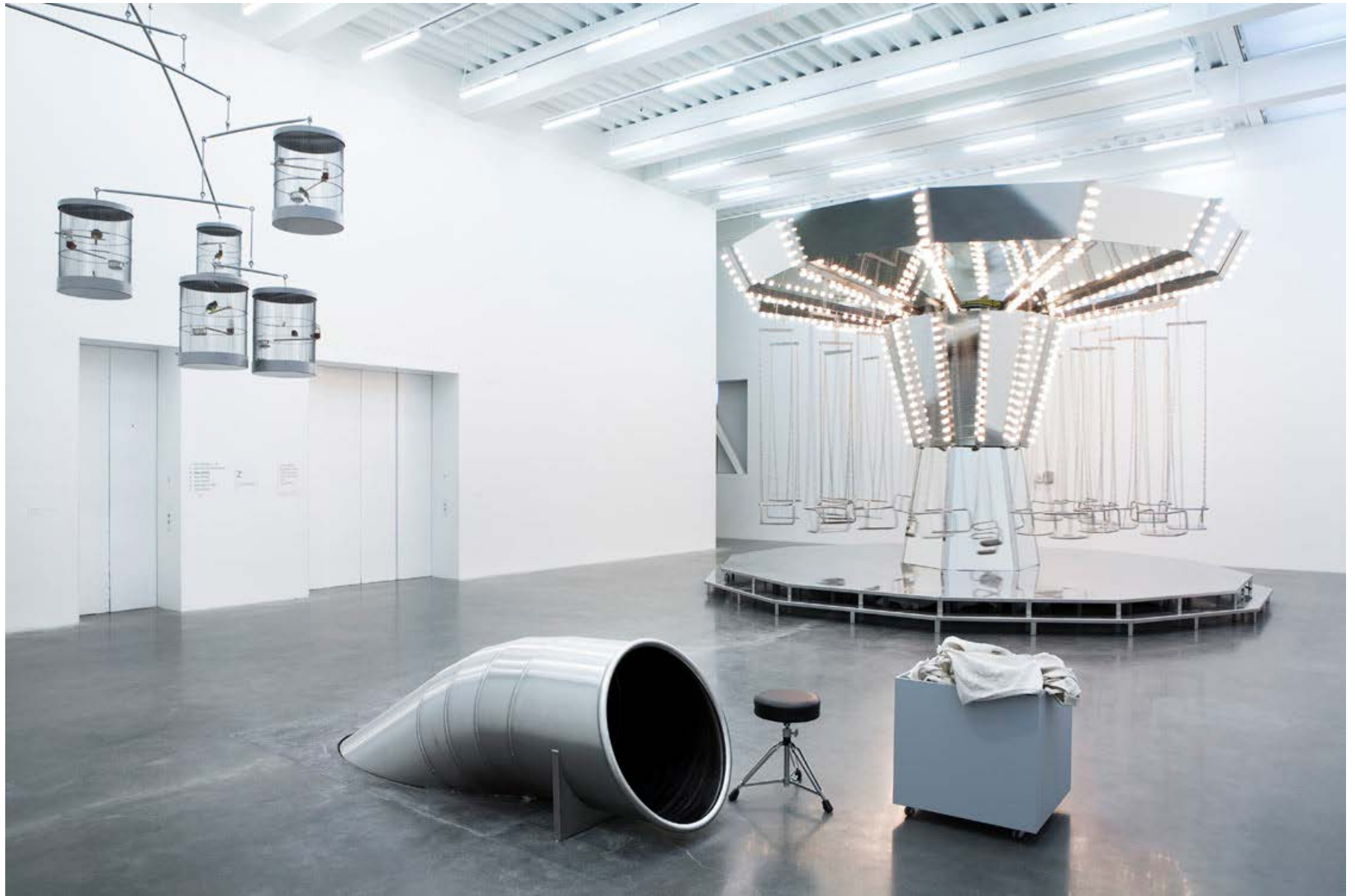
Installation view 3 rd floor of the new museum, New York, 2011