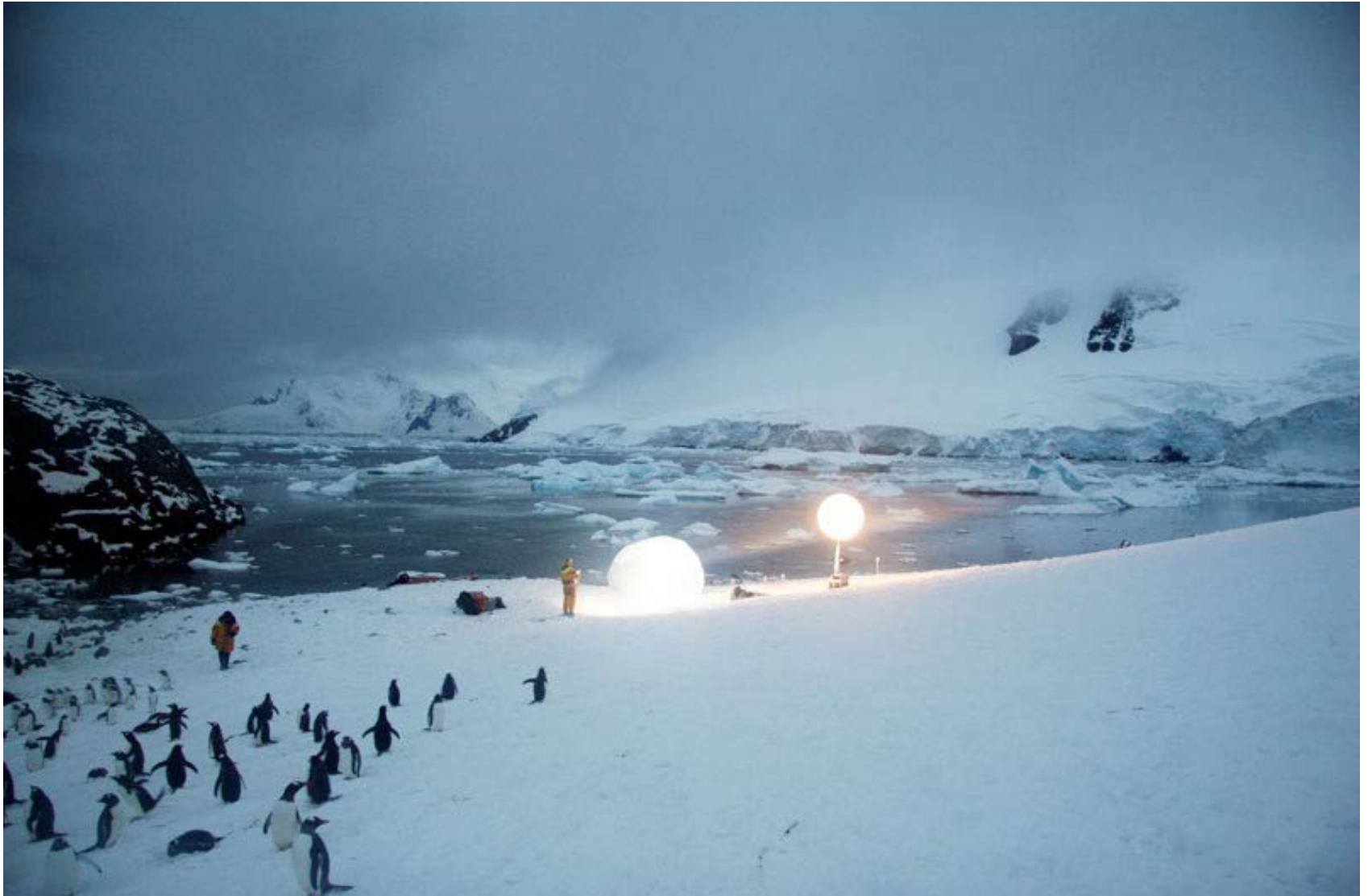
Pierre Huyghe, A Journey that Wasn't , 2005, Antarctic expedition