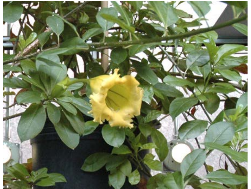
Solandra Greenhouse , 2004, solandra vines, greenhouse, strobe lights, 10X30x18