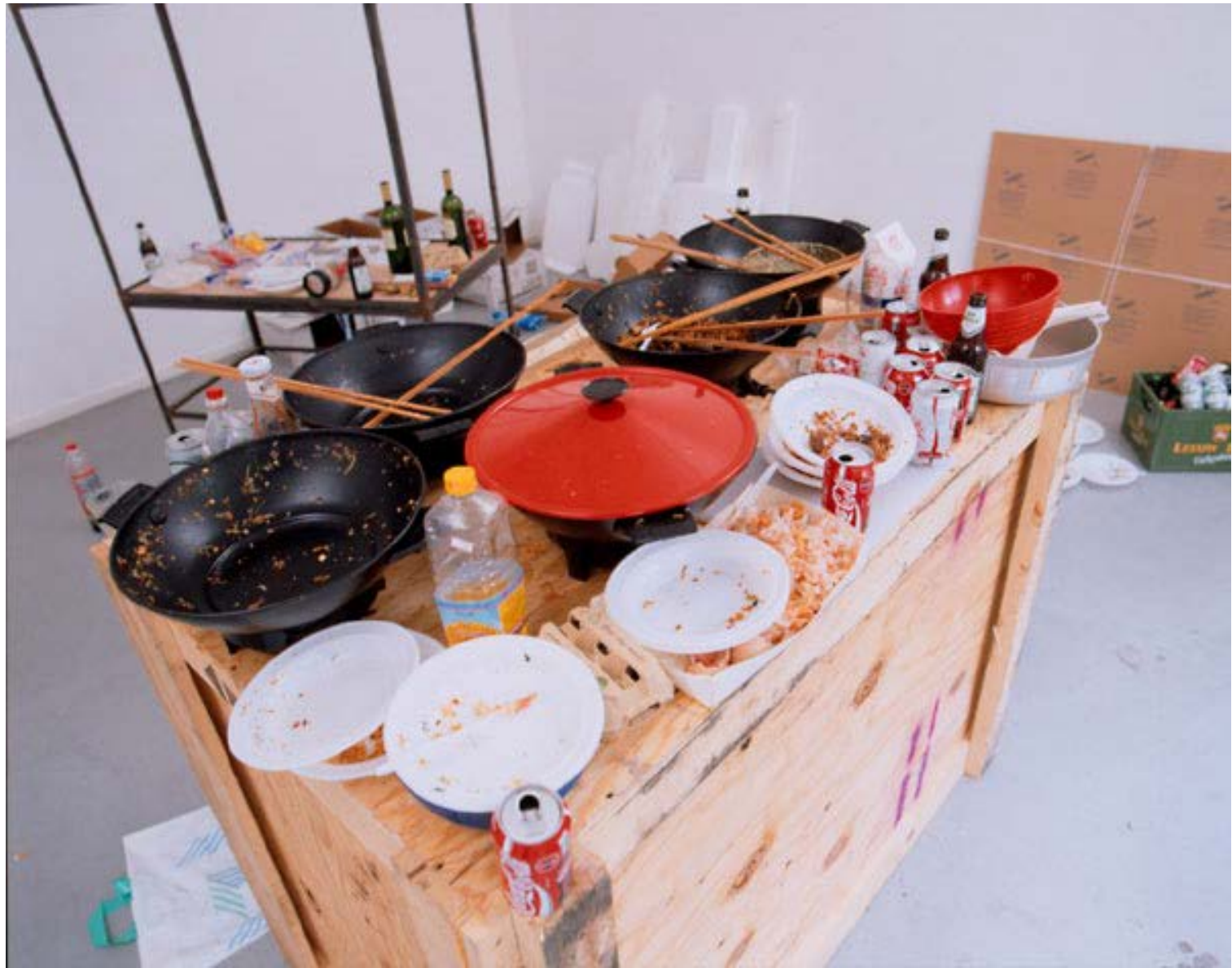
Rirkrit Tiravanija, Untitled (free), 1991, hot plates and other cooking equipment