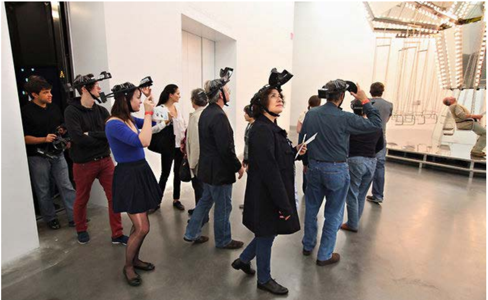
Upside Down goggles, 2011, manufactured goggles, dimensions variable.