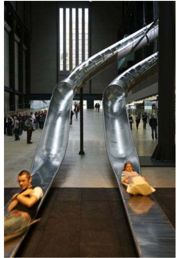
Test Site , 2006, fabricated installation, Turbine Hall, Tate Modern, London