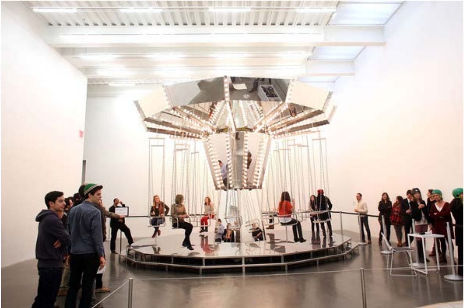
Mirror Carousel, 2011, manufactured carousel, at the new museum, dimensions variable