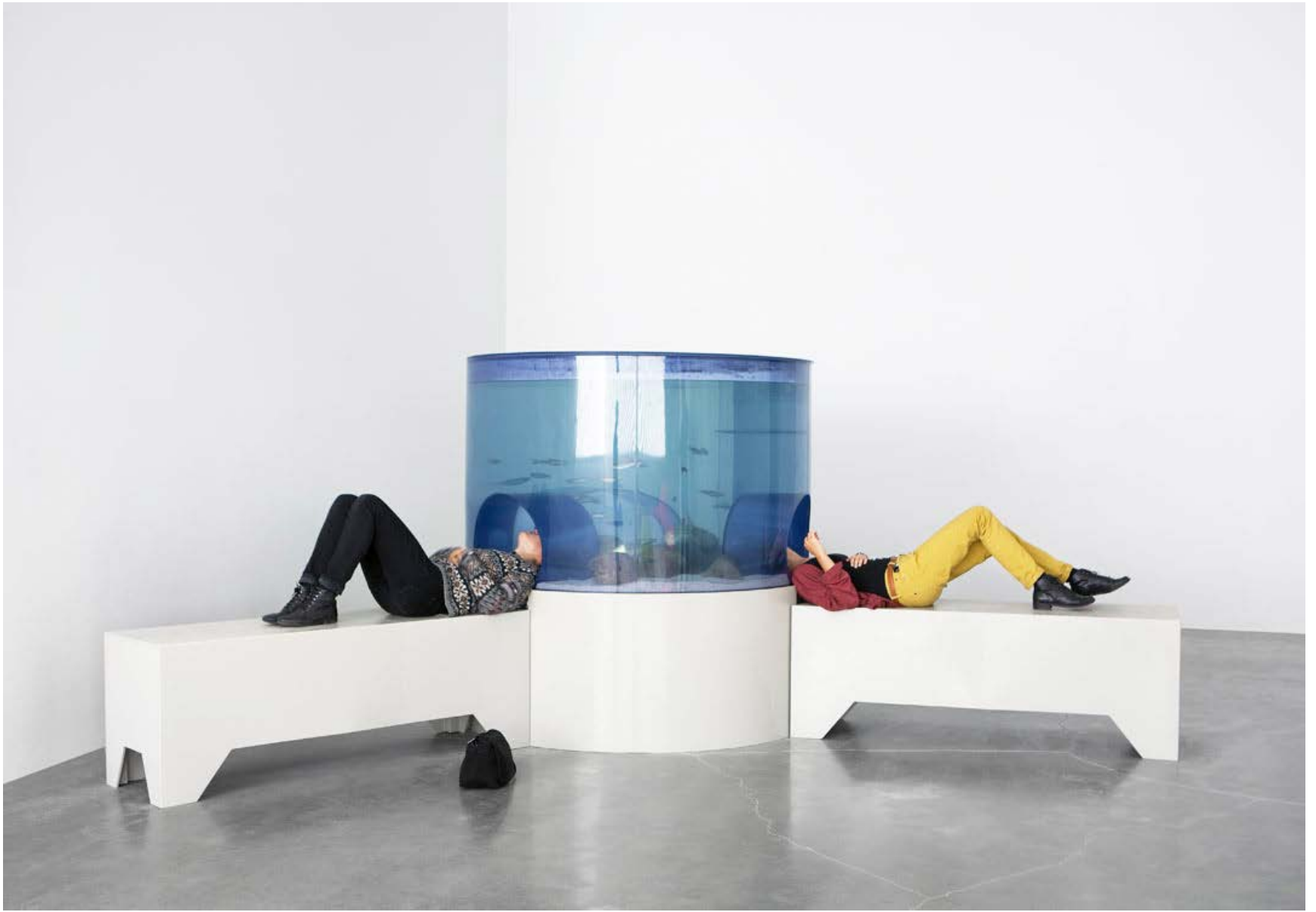
Aquarium, 1996, manufactured fish tank