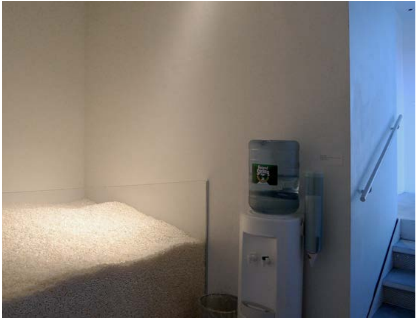
Pill Clock , 2011, empty pill capsules, mechanical components